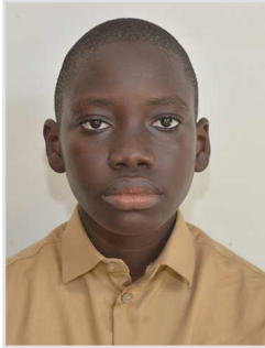
Tableau d'honneur Niveau Seconde